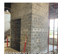
Bridgeton Fire Station

The new Bridgeton Fire Station is progressing according to plan. The elevator shaft is complete. Footing for the emergency generator pad has been poured, with the installation of the reinforced concrete pad to follow. The Authority continues to work closely with the City Administration and Fire Chief. The project is on schedule for completion in Summer of 2026.