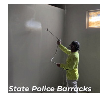
State Police Barracks

The Port Norris Barracks interior work continues to progress with drywall finishing, painting and tile work being done. All of the electrical, plumbing, and HVAC rough work has been completed. The Authority worked with NJSP, the Treasury Department and their vendors to add radio communications to the project. Construction managers are fine-tuning access control, security and, casework installations, prior to delivery. The sitework should begin in August and the final layer of horizontal siding will be installed on the outside of the building. The project on schedule and still within original budget.