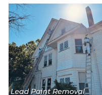
Lead Paint Removal

The Authority, through its ongoing partnership with The Holly City Development Corporation (HCDC) and the Cumberland County Department of Health (CCDOH), is continuing its mission to make Cumberland County lead safe. Together, The Authority, HCDC, and CCDOH are abating and remediating multiple homes built before 1978 that contain lead-based paint. This is an often hidden danger that poses serious health risks to children. Every home completed is another step toward a healthier, safer community for all.