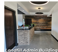
Landfill Admin Building

Construction for the expansion of The Authority's existing Administration Building at the Solid Waste Complex is nearing completion. Staff have begun moving into the newly-renovated building. Outside landscaping and finishing touches are expected to be complete by the end of the month. The Authority's Landfill Gas Header Project has been completed. The project included the continuation of the landfill gas header around landfill Cells 7, 8, and 9 to complete the loop around the entire landfill. This project will help The Authority maximize landfill gas collection. The Authority's Scale House concrete renovations are complete. This project included pouring new concrete around both the inbound and outbound scales.