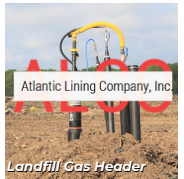
Landfill Gas Header

The Authority's Landfill Gas Header Project has been awarded to Atlantic Lining Company (ALCO). The project includes continuing the landfill gas header around landfill Cells 7, 8, and 9 to complete the loop around the entire landfill. This project will help The Authority maximize landfill gas collection. ALCO is set to begin welding pipe this week, and the project is expected to be complete by late June.