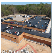
NJ State Police

The Port Norris, Commercial Township State Police barracks construction is firing on all cylinders. With great weather and all materials onsite, all contractors are working hard to get water tight by May 2. The exterior waterproofing and roof membrane are both expected to be complete by the end of April. The roof top units will be set the week of April 28. The mason is following right behind the waterproofing, installing the split face block, brick veneer, and cast stone. Masonry should be complete by mid-May. The plumber, electrician, and tin knockers are working hard to install mains, feeder cables, generator, and electrical gear. Inspections are occurring weekly, and the project is moving along very well. Interior wall framing is to begin the last week of April and be completed by mid-May.