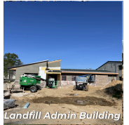
Landfill Admin Building

Construction continues for the expansion of The Authority's existing Administration Building at the Solid Waste Complex. The Landfill Administration Building construction is progressing. Exterior block and windows have been installed. Interior framing and roughing services are complete and sheetrock installation is scheduled to begin within the next few weeks. The project is on schedule, and the Landfill Administrative Building is set to open at the end of June.