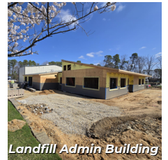
Landfill Admin Building

Construction continues for the expansion of The Authority's existing Administration Building at the Solid Waste Complex. This project includes office renovations and upgrades to the locker rooms and lunchroom. The Landfill Administration Building construction is progressing, and is on schedule to open at the end of June. HVAC, plumbing, and electric is progressing as scheduled. The brick exterior has started, and is expected to be complete within the next week. Windows, roofing, EIFS (stucco), and drywall are scheduled to be installed within the next few weeks.