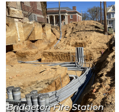
Bridgeton Fire Station

Work continues at the new Bridgeton Fire Station. Framing on the second floor is mostly complete, as ductwork, plumbing and electrical roughing in continues. First floor framing is ongoing, as the new elevator shaft openings have been cut through the existing concrete floors. Protection has been installed for demolition work to continue on the pyro bar wall units that makeup the historic main stair tower walls. These wall units will be removed and replaced with cold-formed metal framing (metal studs). The under slab piping for the sanitary system on the ground floor has been inspected, and is ready to be infilled with concrete. Sitework continues on the generator pad and transformer. The electrical conduits are nearing completion, and the reinforcing mat is waiting to be installed. Completion is planned for Spring 2026, and the firefighters are looking forward to moving into their future home.