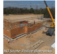
NJ State Police Barracks

Spring has arrived, and with it, major progress has been made on the Commercial Township Police Barracks project. Construction is in full swing with masonry walls, bearing walls, sheathing, trusses, and generator and transformer pads all being completed. As the building begins to take shape, the focus now shifts to exterior sheathing, roof sheathing, roofing and interior systems—ductwork, electrical, and plumbing rough ins being underway and moving swiftly.