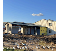
Landfill Admin Building

Construction continues for the expansion of The Authority's existing Administration Building at the Solid Waste Complex. This project includes office renovations and upgrades to the locker rooms and lunchroom. Demolition of the existing building is nearing completion. Both footings and blockwork are complete. The next phase of the project will be installing the walls of the building. The project is on schedule and is projected to be complete by the summer of 2025.