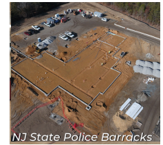
NJ State Police Barracks

Work continues on the State Police Barracks project with footings and foundations completed. Underground electrical and plumbing work is complete in anticipation of pouring the building pad on Monday, January 6. The site contractor has installed some of the curbs to allow for new electric utility pole layout by ACE. The next phase of the project will include the concrete reinforcement, moisture barrier, stone, and concrete pad. Roof trusses and building framing materials will be delivered in January.