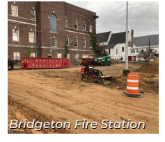
Bridgeton Fire Station

Work at the Bridgeton Fire Station has begun with blacktop and islands removed in the rear of the building, contractor trailers in place, and lights on. Demolition has begun inside the building. Engineering review for many of the long lead time items is also taking place. Ace's lighting poles in the rear of the parking lot are scheduled for disconnect by the utility and removal by the contractor. It is just the beginning of a long journey to the completion of the new Bridgeton Fire Station scheduled for completion in the spring of 2026.