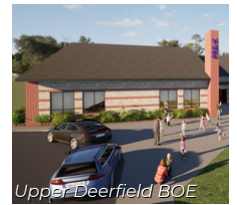
Upper Deerfield BOE

The New Jersey Department of Education – Office of School Facility Projects has approved the expansion to the Charles F. Seabrook school in Upper Deerfield Township. The one-story 18,840 square-foot addition will provide 12 additional pre-kindergarten classrooms and restrooms. The project cost is estimated at $9MM with just over 55% being covered by state funds with the balance being paid for by the district. This project structure is possible because of newly created legislation that combines Township, BOE, County, and Authority partnership to leverage grant funding that would not otherwise be available. This innovative partnership marshalled by The Authority leverages 50% share rather than the typical DOE 16% which results in lower tax implications to Township residents. The district has partnered with the Authority to bond and manage the construction with the bond being guaranteed by Cumberland County. Special thanks to Assemblyman Bailey for his guidance and advocacy throughout the legislative process. The project will be going out to bid in Q1 2025 and is expected to be complete in Q1 2026.