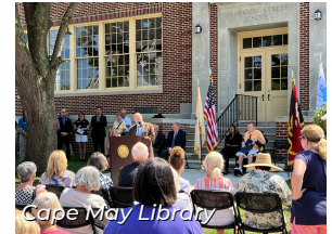
Cape May Library

The ribbon cutting for the new Cape May City Branch Library occurred on Thursday, June 13. Activities began with a "book brigade," in which volunteers lined up along the quarter-mile distance between the old and new libraries, to hand-transport the last 100 books. After speeches by local dignitaries, and appearances by state officials, the public was let in to the new library for the first time. With approximately 300 to 400 people in attendance for the dedication, and more arriving through the afternoon, the opening was a tremendous success.