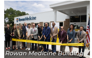
Rowan Medicine Building

The ribbon cutting for the Rowan Medicine Building took place on Tuesday, June 11 at the Rowan College of South Jersey Cumberland Campus. This state-of-the-art facility will house three vital programs that will significantly benefit the citizens of our county: the C.A.R.E.S. Institute (Child Abuse Research Education & Service Institute), the N.M.I. (NeuroMusculoskeletal Institute), and the R.I.S.N. Center (Regional Integrated Special Needs Center). This new addition to the 'Eds and Meds' corridor will greatly enhance healthcare and education in our community.