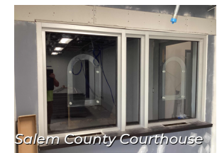
Salem County Courthouse

Work continues to progress at the Salem County Courthouse. Building A renovations are ongoing. Walls are being prepped for painting, while electrical and systems wiring and cabling continues. The ceiling grid is complete and light fixtures have been installed. The ceiling tile will be installed upon final above ceiling inspections. Existing Courthouse CUPOLA has been removed, with new CUPOLA steel being installed. The SALLYPORT (Prisoner Intake) footing, foundations, and slab have been started.