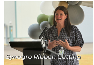
Synagro Ribbon Cutting

The ribbon cutting for the new Cumberland County Biosolids & Organics Recycling Center took place on Thursday, June 27. The facility is a state-of-the-art 103,000-square-foot, in-vessel composting process building, utilizing automated aeration, and turning equipment. New Jersey generators will be able to leverage Synagro's investment in green infrastructure for biosolids and organics management, thereby producing approximately 38,000 tons of Class A compost annually. Synagro has teamed with The Authority to provide the facility with renewable energy, creating a highly sustainable, environmentally and community-friendly solution.