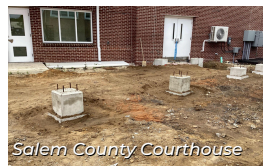
Salem County Courthouse

Salem County Courthouse Building A & C renovations continue. Sallyport footings and foundations have begun. Prepping for CUPOLA install on the old Courthouse, Building A, and Security/CCTV work are ongoing. The priming and painting process continues. Both tile work being completed and plumbing fixtures are being set. The ceiling grid is completed, and the tile will be installed once inspections are complete.