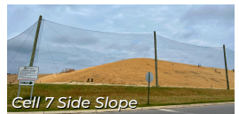
Cell 7 Side Slope

The Authority is beginning its Cell 7 Side Slope and Tow Drain Project in the upcoming weeks. C. Abbonizio Contractors were awarded the bid for the project at the end of May. The project consists of placing rain cover and wind defender on the Cell 7 slope and installing a tow drain beneath the liner to capture leachate. It is expected to be complete by the end of the summer.