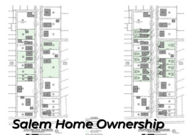
Salem Home Ownership

The Authority is working with the City of Salem to develop 10 single-family homes. The homes will be newly constructed on currently vacant and/or abandoned lots/homes on Linden Street. The 3B 2 BA will be sold for approximately $90-$110,000. Pre-development activities and funding applications are underway. Construction should commence in late fall and units should come online beginning in Summer 2025.