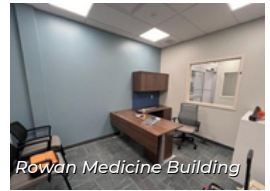
Rowan Medicine Building

The Rowan Medicine Building Project has received the furniture, clinical equipment, and network equipment deliveries. Final commissioning has been completed and the building is ready for occupancy. Final CO is expected by June 7. The punchlist work is ongoing, and the building is being cleaned and prepared for employees and patients. CARES will be moving into the new space in June, followed by RISN and NMI before the end of 2024. The ribbon cutting ceremony is currently scheduled for Tuesday, June 11 at 12:00pm.