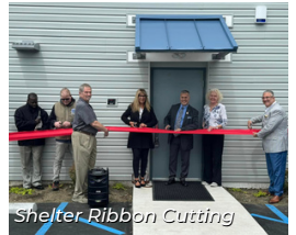
Shelter Ribbon Cutting

On Friday, May 17, Rural Development Corporation hosted a ribbon cutting event for the renovation and opening of a 7-room housing unit, aka "Building 3" (for mixed gender families) and the addition of a 4,000 square-foot warehouse for the Southern Regional Food Distribution Center. Over 75 community members and elected officials attended the event. The Authority in partnership with Cumberland County, the City of Vineland, and Rural Development Corporation leveraged the pre-development funds of the Authority along with a grant from the Department of Housing and Urban Development (HUD) and funds from Cumberland County and the City of Vineland to make these projects possible. Both facilities were able to be renovated to address the growing issues of homelessness and food insecurity in the community.