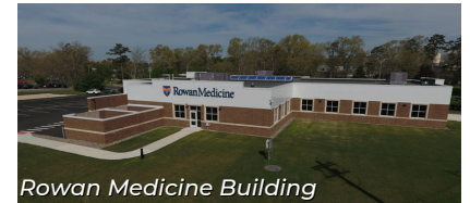
Rowan Medicine Building

The Rowan Medicine Building received its final building inspection on Monday, April 29 and has been cleared for TCO (Temporary Certificate of Occupancy). Furniture is scheduled for delivery in May 2024, followed by clinical equipment. The Ribbon cutting ceremony is scheduled for Thursday, June 6 at 12:00pm.