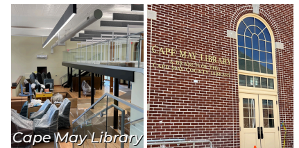
Cape May Library

The work remains on schedule for a June ribbon cutting. Punch list touchups are well underway, and the furniture is being brought in and assembled. Storefront framing has arrived for the entry vestibule and installation has started. The site is being cleared of material, equipment and debris, and final items related to sitework are to be addressed in the upcoming days. The weather has turned just in time to begin lawn restoration.