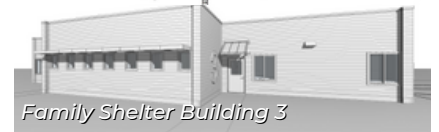
Family Shelter Building 3