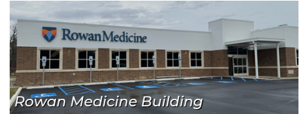
Rowan Medicine Building

The building now has full electric allowing the interior finishes to be completed. HVAC startups, building controls, and fire alarms will be completed by March. Interior finishes of administrative work areas are in progress and the medical space finishes will be complete in March. All of the furniture, finishes, and equipment have been ordered and are expected to arrive throughout April and May.