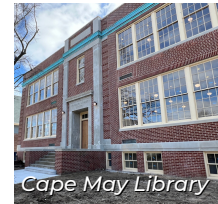
Cape May Library

The primary work in the School Block of the building is mostly complete and focus is now set on the Gym Block. The remaining metal ceiling installation is in progress. Finishes, the completion of lighting, and the installation of security cameras will follow. Data wiring is nearly complete and plans for Verizon to complete their installation will be next. Installation of the restored, field-stained wood doors is in progress, as is the installation of the door hardware. Interior storefronts, glass stair and mezzanine railings, wood flooring in the main library space, and final inspection/approval of the elevator will be completed as well.